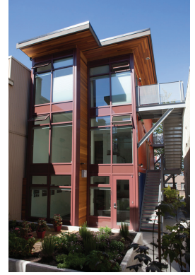
Pictured here: the transition from shipping containers to shipping container housing (Oneesan Container Housing Project)