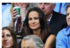
Celebrities influence choice of baby names