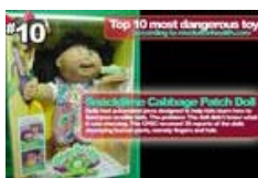
Photos: Top 10 most dangerous toys