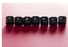
Taking the 'man' out of 'romantic'